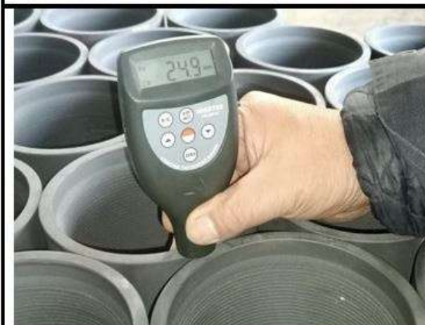
Check phosphating film thickness