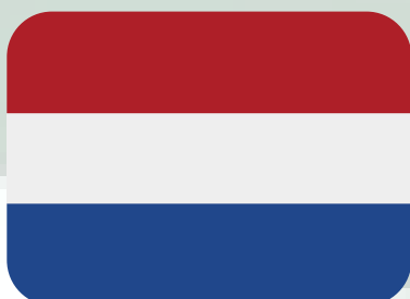
LA HAYA (Holanda)