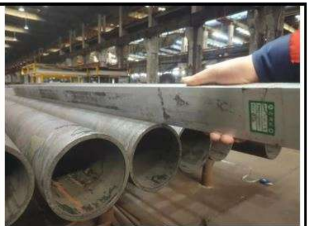
Check pipe end straightness